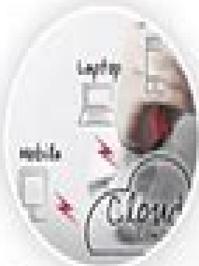
Computers and Information Technology