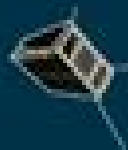
GOMSPACE CUBESAT PLATFORM