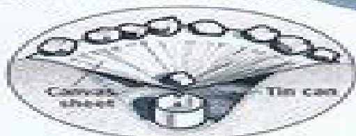
Airmen stranded in the desert can make a canvas and stone still to collect water.

Ex took a claim. Saint-Ex took a claim. Ex took a claim. Ex took a claim. Ex took a claim.