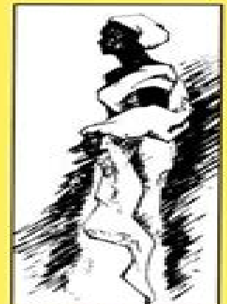
JAFDA AND THE WEDDING