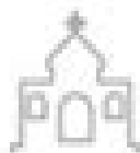
Local Church Operating Expenses