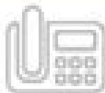
Equipment Other than evangelistic equipment