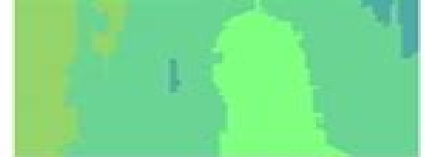
(b) Disparity map