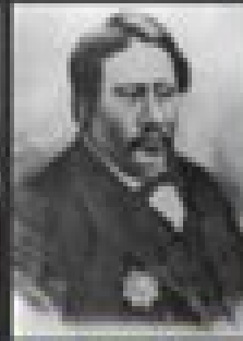
Kamehameha V Lot Kapuāiwa