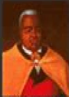
Kamehameha I The Great