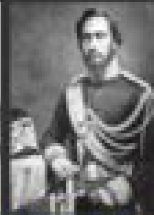
Kamehameha IV Alexander Liholiho