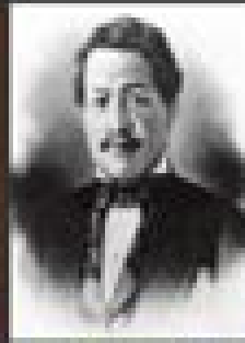
Kamehameha III Kautelaouli