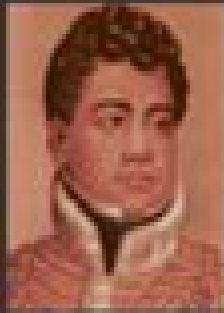
Kamehameha II Liholiho