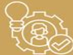
The ability to recognize and organize skills