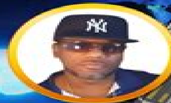
RA CLOUD NAVY SUPER SOLDIER