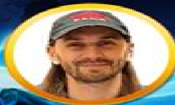
DYLAN MONROE DEEP STATE MAPS