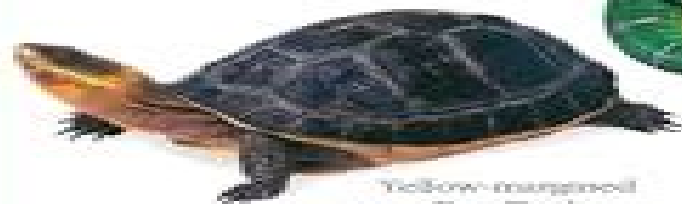
Yellow-margined Box Turtle