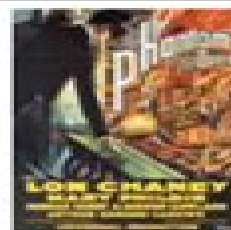
The Phantom of the Opera 1925

43005-8 Noble—Color Your Own Great Flower Paintings $2.95