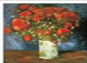
VAN GOGH Poppies

The best way to sell Dover card books is in a FREE 20 Large Pocket Spinner Rack. Call 800-223-3130 for details.