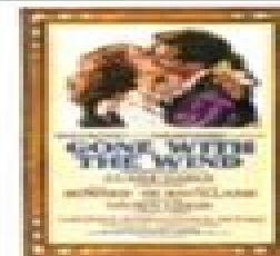
Gone With the Wind 1939