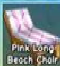
Pink Long Beach Chair