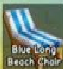
Blue Long Beach Chair