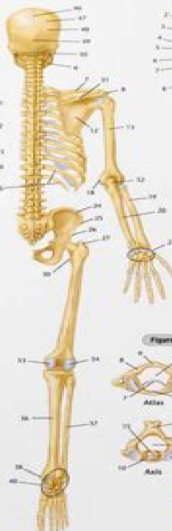
Figure 2: Skull & Vertebral Column (Lateral View)