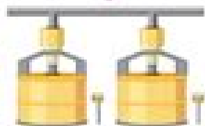
Separation via centrifuge.