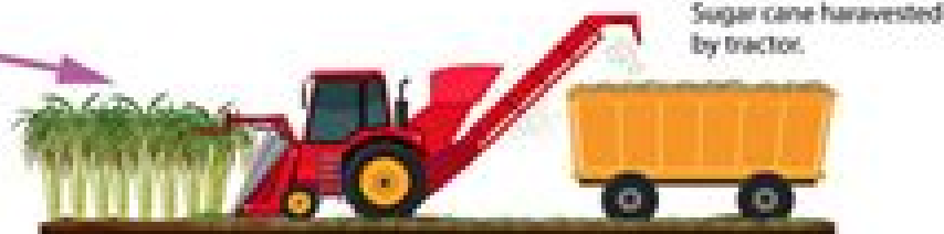
Sugar cane harvested by tractor.