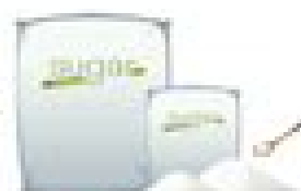
Sugar production and packaging.