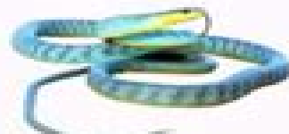
Common Tree Snake