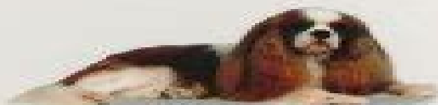
Cavalier King Charles