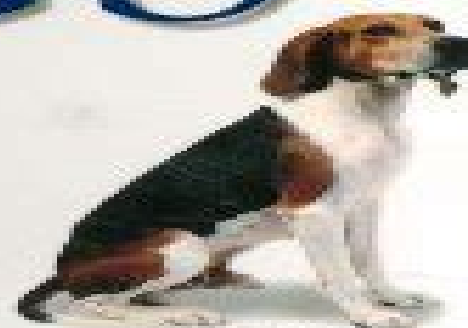
Treeing Walker Coonhound