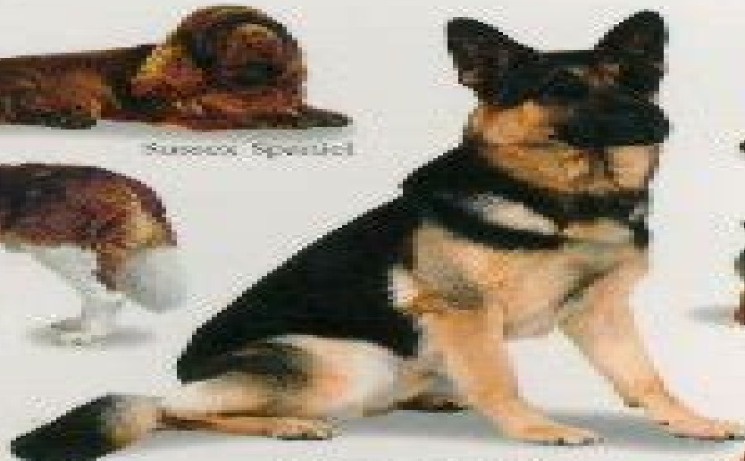
German Shepherd Dog