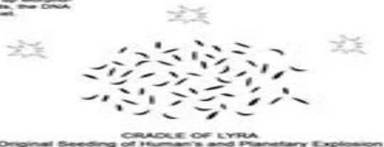
CRADLE OF LYRA Original Seeding of Human's and Planetary Explosion

Structured bands of EMF light-sound-tone (vocal waves) make up Morpho- genetic Fields, the DNA Instruction Set.