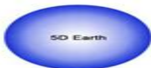
Magnetic Repulsion Zone