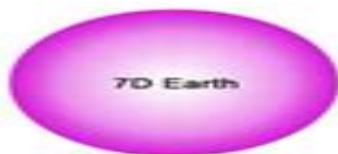
Magnetic Repulsion Zone