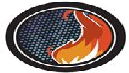
Hail and Fire Exodus 9:13-35