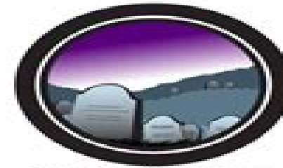
Death of Firstborn Exodus 11:1-12:36