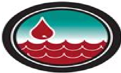
Waters Turn to Blood Exodus 7:14-25