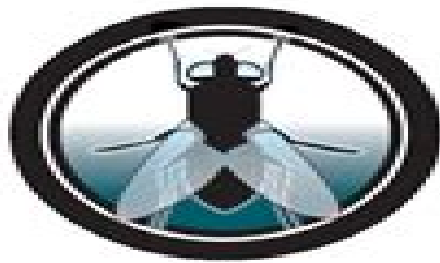
Flies Exodus 8:16-28