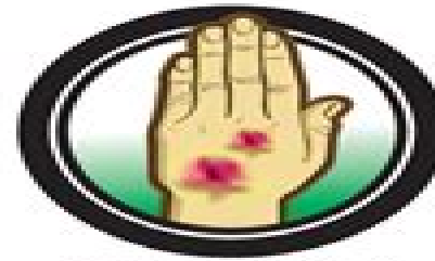
Unhealable Boils Exodus 9:8-12