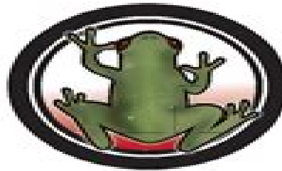
Amphibians (Frogs) Exodus 7:26-8:11