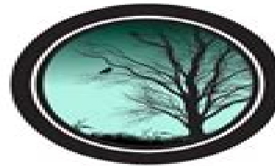
Darkness Exodus 10:21-29