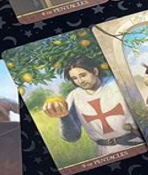
9 OF PENTACLES