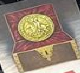
ACE OF PENTACLES