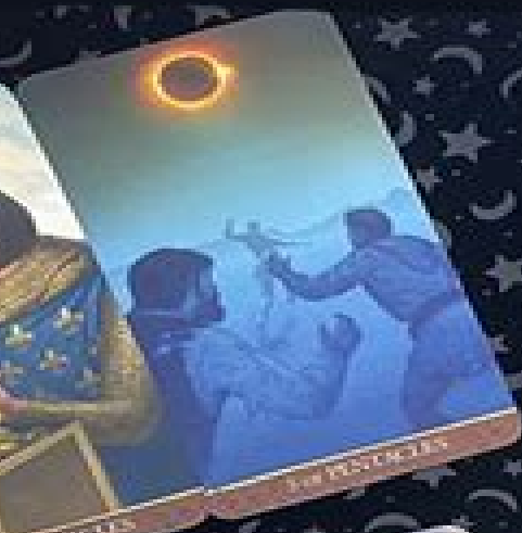
5 OF PENTACLES