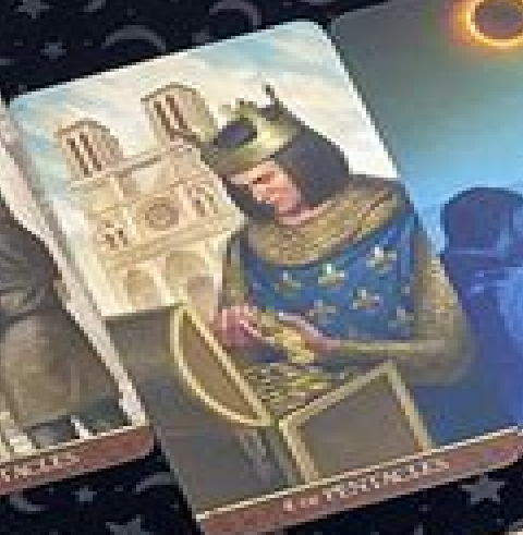
4 OF PENTACLES