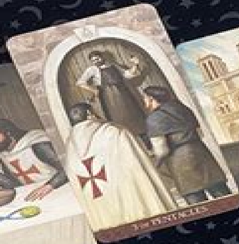
3 OF PENTACLES