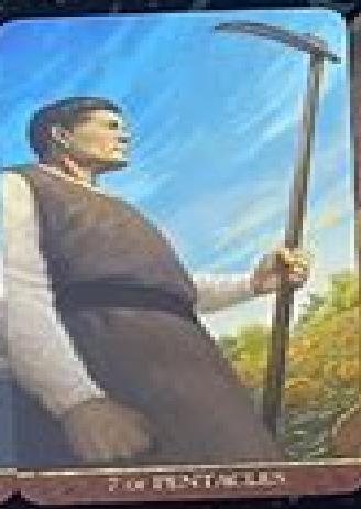
7 OF PENTACLES