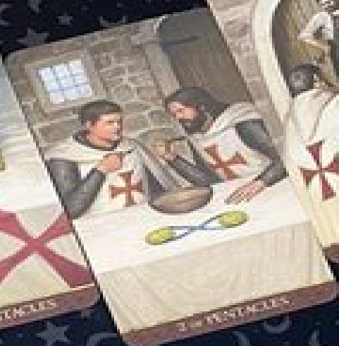
2 OF PENTACLES