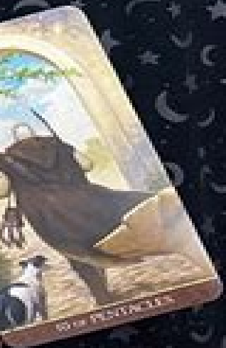
10 OF PENTACLES