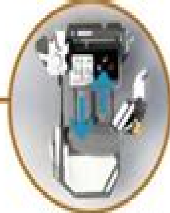
Slides to suit the size of your hand