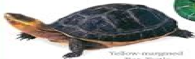
Yellow-margined Box Turtle