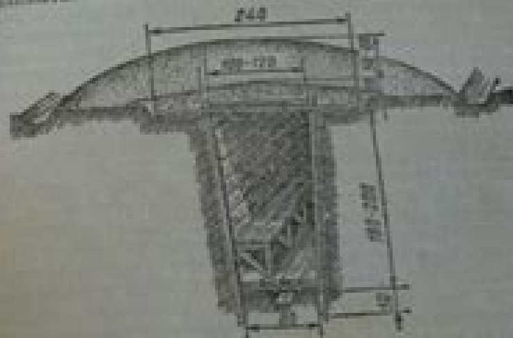
Part 8. The preparation of...

крытия называется перекрытой шалью (рис. 5). Тренировка, стрижка и устройство ошейника круглой шали выполняются аналогично тому, как это делается при строи-