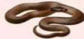
Little Whip Snake