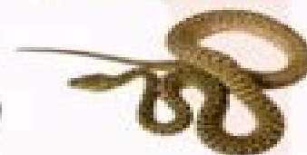
Torresian Carpet Python