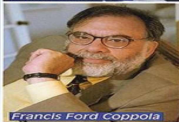
Francis Ford Coppola