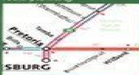
Handy trip maps for easy route planning