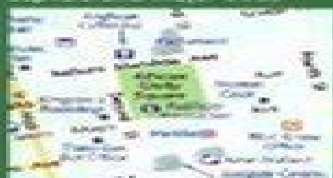
Detailed maps of national capitals and major cities