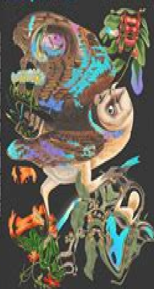
ILLUSTRATION BY KAREN JOE FORD

JEFF VANDERMEER EDITED A NOVEL BOOK 3 OF THE CRIMINAL MIND SERIES