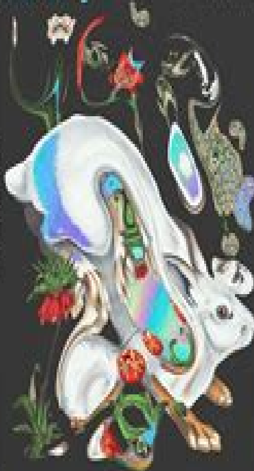
ILLUSTRATION BY K. J. FORD

JEFF VANDERMEER EDITED A NOVEL BOOK 2 OF THE CRIMINAL MIND SERIES