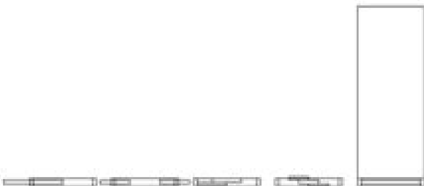
Pocket DoublePocket SlidingDouble SlidingTriple Overhead