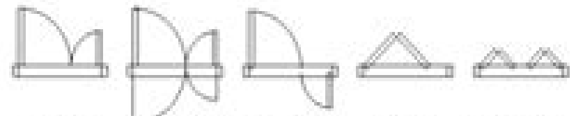
Uneven UnevenOpposing UnevenOpposing Bifold BifoldDouble