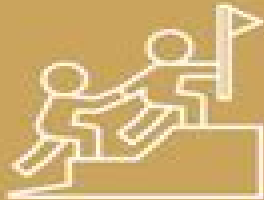
Leadership and people management