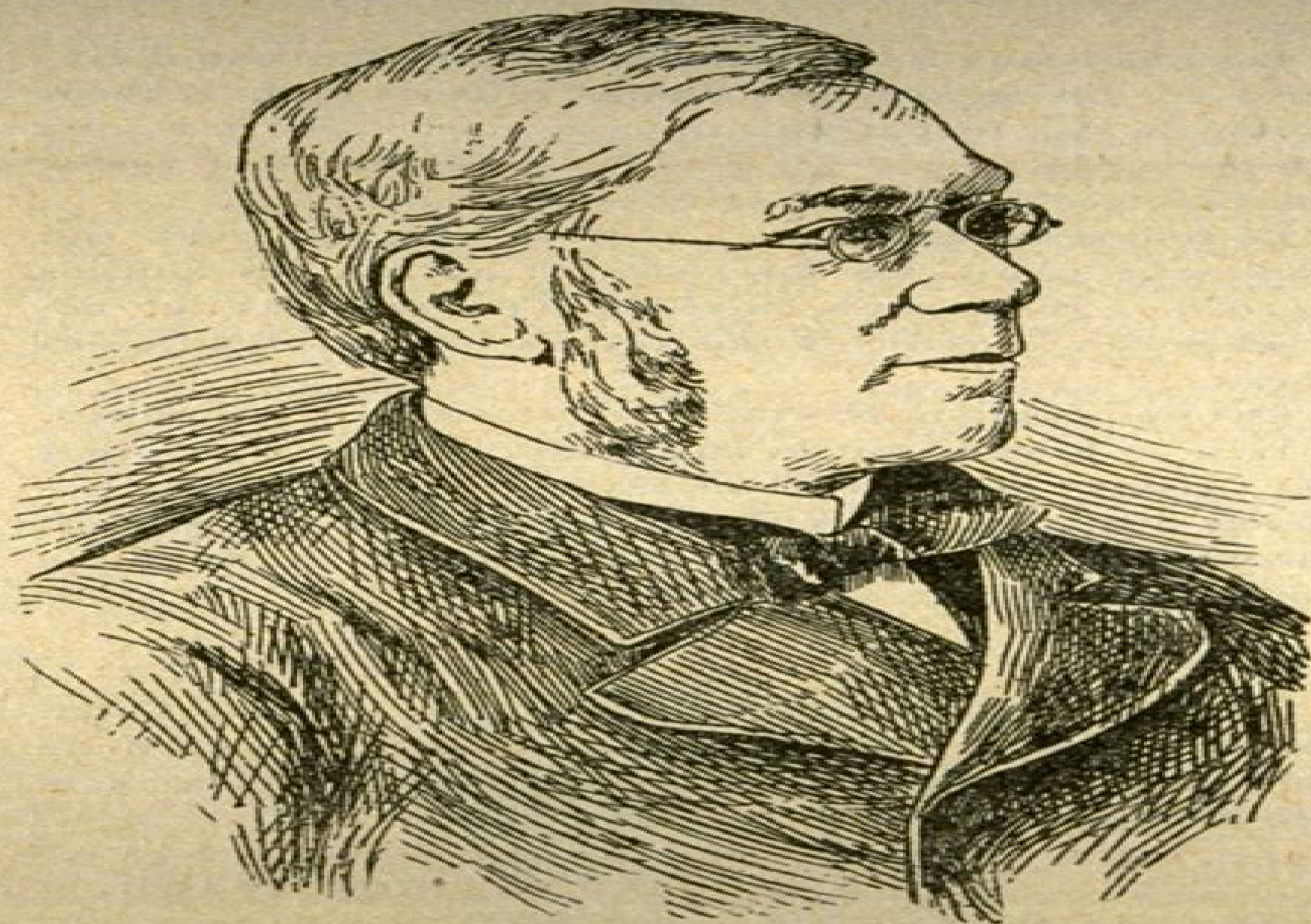
SIR OLIVIER MOWAT Lieutenant-Gouverneur d'Ontario