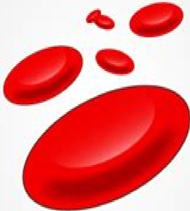
(a) Normal Cell