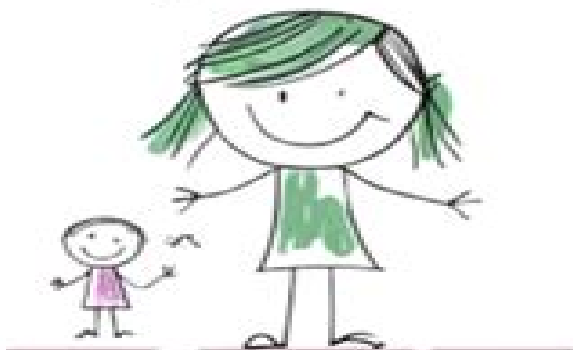
Dawning Realism Stage