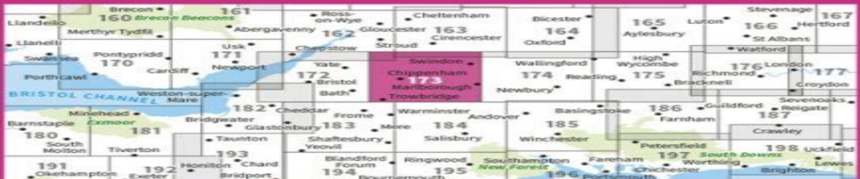
Cover photo: Castle Combe © Andrew Caffrey

For more information about World Heritage visit: whc.unesco.org