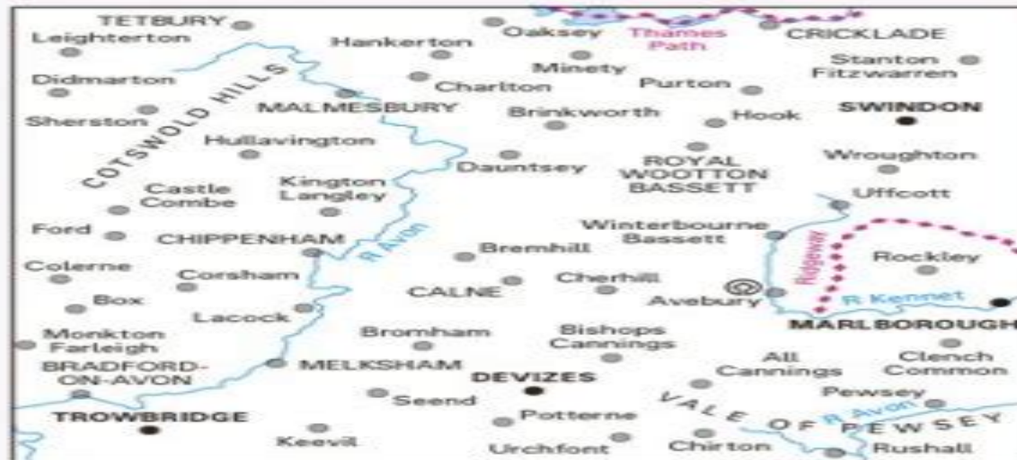
Area covered by sheet 173