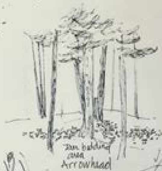
San holding area Arrowhead