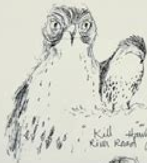
Kill Hawk near SEA River Road, Charleston