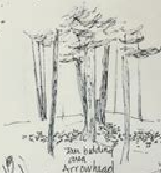
San holding near Arrowhead