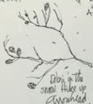
Obey in the snow. Hike up Arrowhead