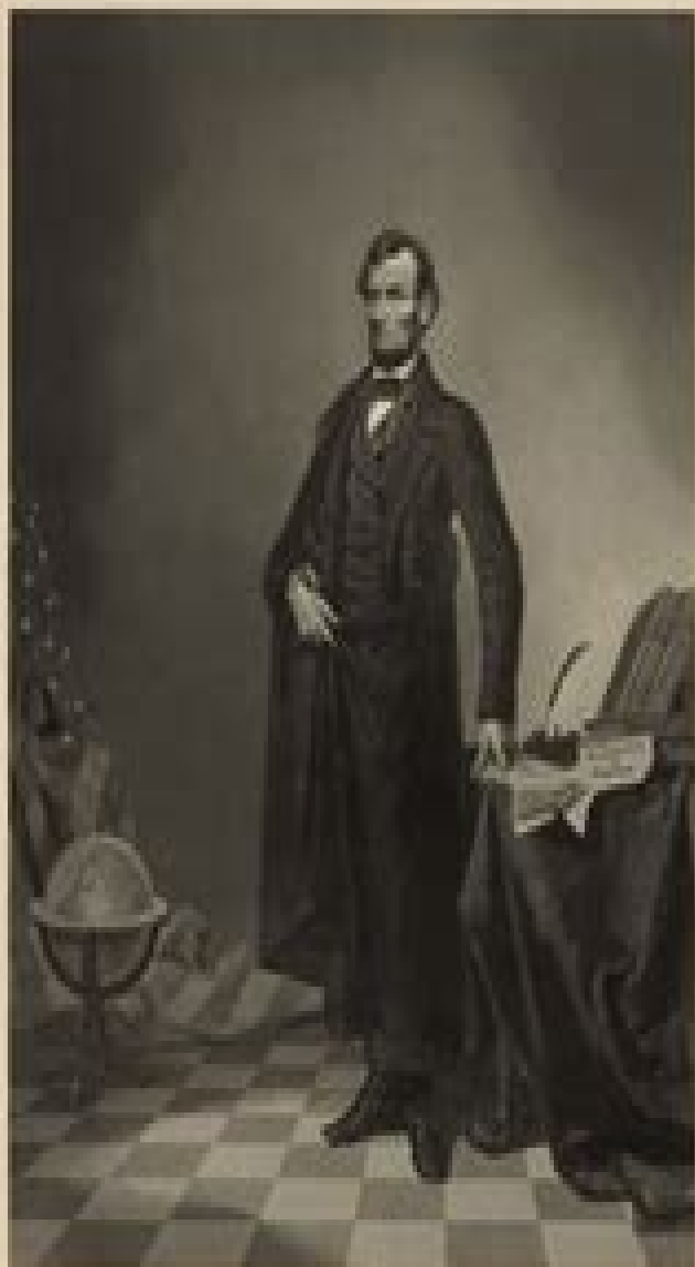
ABRAHAM LINCOLN 1860-1865