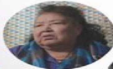
SHOAL LAKE 40