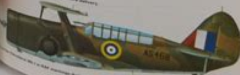
Curtis SBC-4 in US Navy markings during 1939