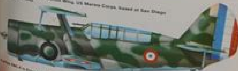
Curtis SBC-4 in French markings before delivery