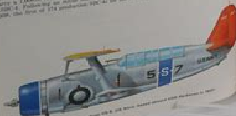
Curtis SBC-4 of Squadron VS-3, US Navy, based at NAS Alameda in 1939