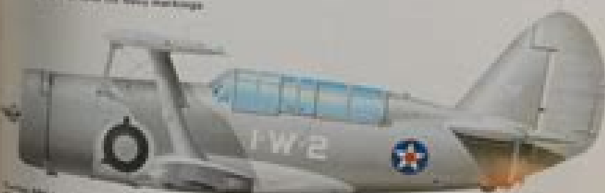
Curtis SBC-3 of the 1st Scout Wing, US Marine Corps, based at San Diego, California in 1936