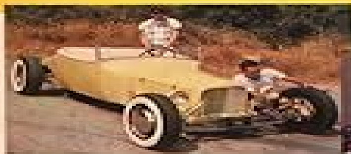
By Robert E. Petersen and the Editors of Hot Rod Magazine