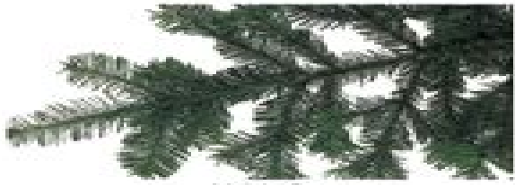
Noble fir Abies procera syn. A. nobilis