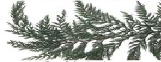
Port Orford cedar Lawson cypress Chamaecyparis lawsoniana