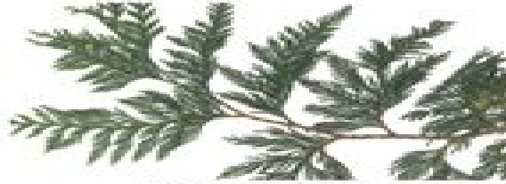
Western red cedar Thuja plicata