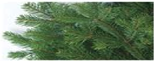
White fir Abies concolor