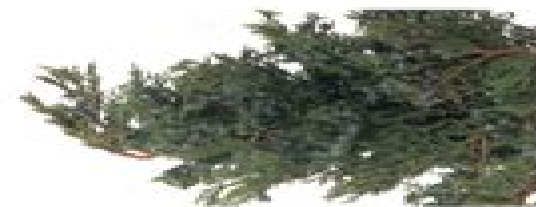
Juniper Juniperus communis