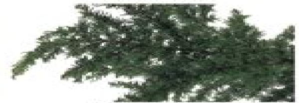
Mountain hemlock Tsuga mertensiana

(NOTE: Coniferous hemlock is not related to the poisonous herb Conium, which is also commonly known as hemlock.)