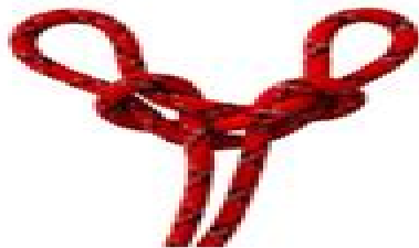
SPANISH BOWLINE KNOT