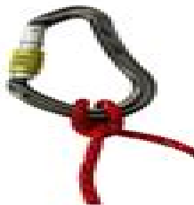
CLOVE HITCH KNOT