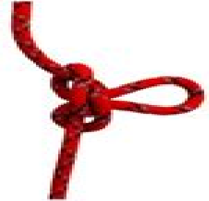
ALPINE BUTTERFLY KNOT