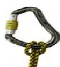
GIRTH HITCH KNOT