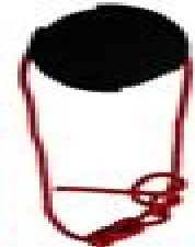
TRUCKER'S HITCH KNOT