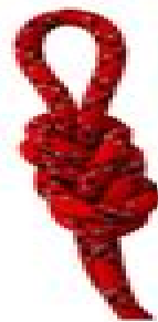
FIGURE EIGHT ON A BIGHT KNOT