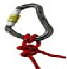
ROUND TURN AND TWO HALF HITCHES KNOT