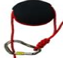
TENSIONLESS HITCH KNOT