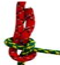
SHEET BEND KNOT