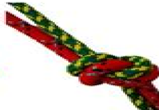
EUROPEAN DEATH KNOT