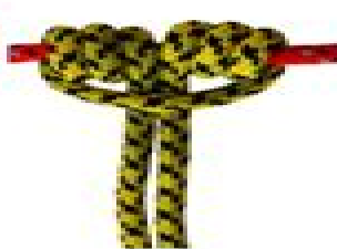
PRUSIK HITCH KNOT