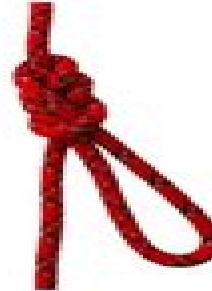
DIRECTIONAL FIGURE EIGHT KNOT