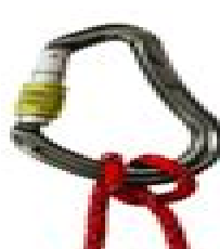
MUNTER HITCH KNOT