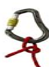
HALF HITCH KNOT