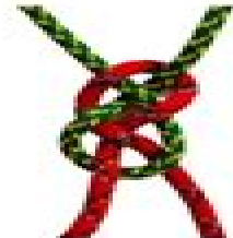
CARRICK BEND KNOT