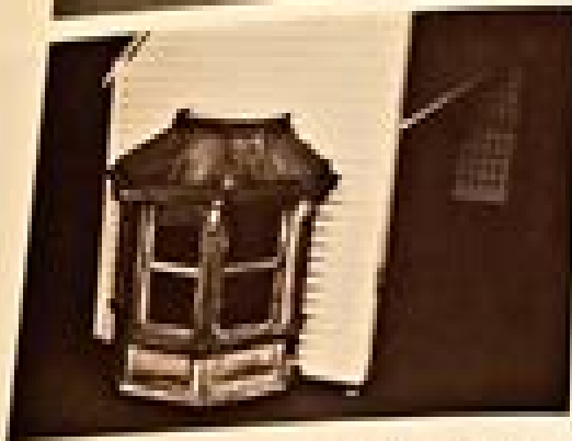
View of the finished cottage from the street and chimney side of the two windows.

The coverings and goings of sea captains inspired the design of this cottage by the sea. Weary sailors would remember the meals served and the respite they would receive in such a home. As returned they might bring passengers from foreign lands to embellish the house. And so the imaginary captains' treasures were interpreted into its design—circular staircases from France, Palladian doors from Virginia, and a bay window from England.