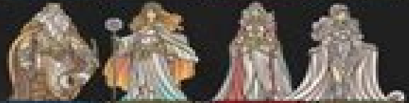
DAHBOG LADA ZORYA MOKOSH