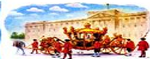
1760—THE STATE COACH

Soon after George III's accession in 1760, the great gilded State Coach, that was to carry all his successors to the Abbey, was commissioned. Designed by Sir William Chambers, with panels painted by Cipriani and carving by Joseph Wilton, it was finished in 1762.