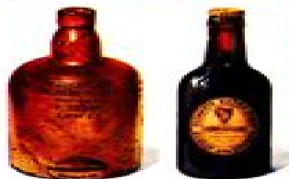
Left: Guinness stone bottle used with glass, used not later than 1850. Right: Guinness bottle today.

It is well over a century since this illustration to the Pickwick Papers was published. That "Pick" drew Sam Weller writing his Valentine in front of a Guinness placard shows how widely Guinness was known in the early eighteenth century. In "Sketches by Boz," among the characters of Mrs. Blime, "first there came a large hamper of Guinness's stout and an umbrella." And later:—"Married!" said Mrs. Blime, taking the pill and a draught of Guinness—"married? Impossible!"