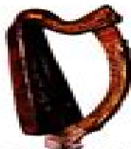
1760—THE O'NEILL HARP

The harp on the Guinness label is probably the oldest European harp. It was last played in 1760, the year after the first Arthur Guinness acquired the brewery in Dublin where Guinness has been brewed during ten reigns. The O'Neill harp is now in Trinity College, Dublin.