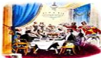
SUPPER FOR MR. DISRAELI

Soon after George III's accession in 1760, the great gilded State Coach, that was to carry all his successors to the Abbey, was commissioned. Designed by Sir William Chambers, with panels painted by Cipriani and carving by Joseph Wilton, it was finished in 1762.