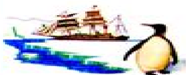
DISPATCHED WITH EXPEDITION

Guinness is a great traveller. A member of Sir Douglas Mawson's Antarctic Expedition of 1912 wrote:—"The stores were in good condition after 18 years; cocoa, salt, flour and matches were actually used afterwards. There were also four bottles of Guinness which, although frozen, were said to have been put to excellent use."