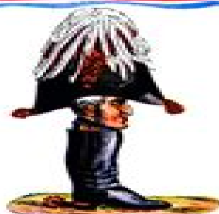
A SOLDIER AT WATERLOO

In 1817, the first year of Queen Victoria's reign, Disraeli wrote to his sister, Sarah:—"So, after all, there was a division in Queen Victoria's first Parliament—yes to 26. I then left the house, none of us scarcely having dined. The tumult and excitement unprecedented. I dined or rather supped at the Carlton with a large party of the flower of our side off oysters, Guinness, and bottled ham, and got to bed at 11 past 11. Thus ended the most remarkable day hitherto of my life."