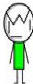
fig. 1: what scratchy looks like

First, I'd like to preface that me and Scratchy are two different people. Scratchy (comic maker, not character) uses me whenever he wants to be funny.