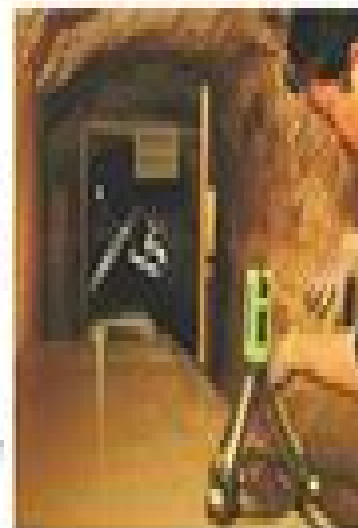
Detectors being set up in Queen's Chamber

The technology measured muons, a by-product of cosmic rays from stars exploding in the universe and raining down to earth at nearly the speed of light. More muons pass through voids than through stone, as stone absorbs them. Detectors were placed in the Queen's chamber, the descending passageway and outside the pyramid near its north face.