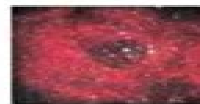
Rosette Nebula in the constellation Monoceros

The clearest recognition guides available