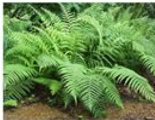
e. Plantae - plants