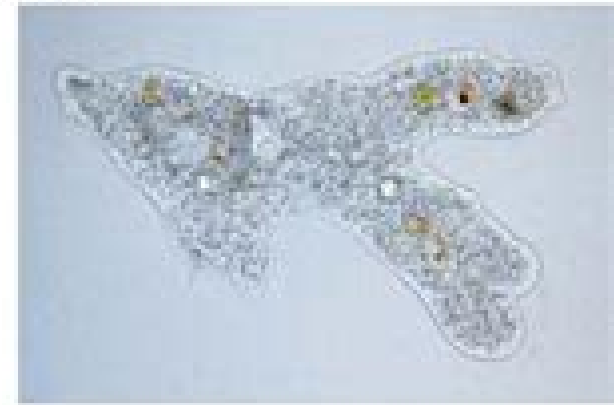
c. Protista - single-celled organisms