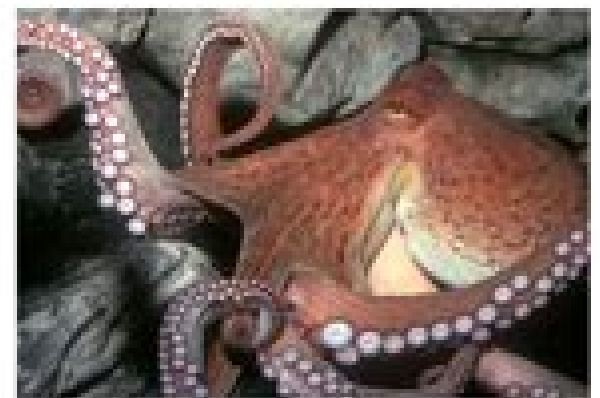
f. Animalia - animals