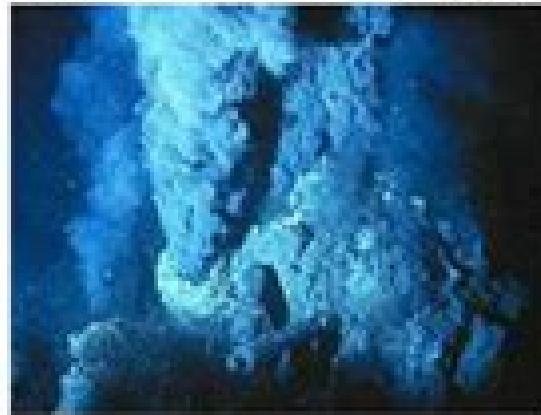
b. Archaeobacteria - extremophiles