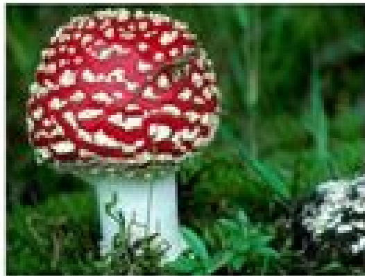
d. Fungi - fungus and mold