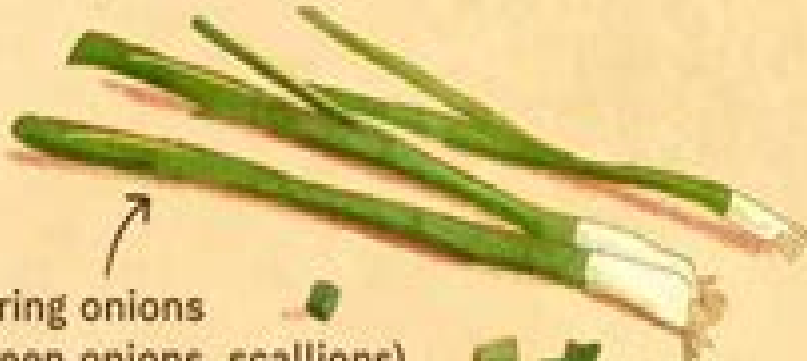
Spring onions (green onions, scallions)