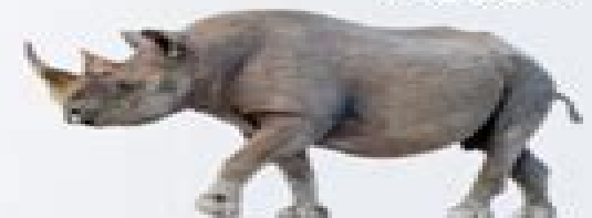
West African Black Rhinoceros