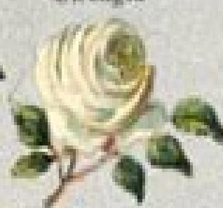
White rose Purity